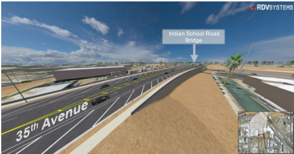
Viewpoint south of Indian School Road along 35 th Avenue, looking north along 35 th Avenue at the proposed Indian School Road/35 th Avenue elevated intersection.