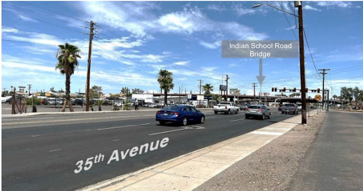
Viewpoint south of Indian School Road along 35 th Avenue, looking north along 35 th Avenue at the existing Indian School Road bridge. Photo taken near 3839 N 35th Ave, Phoenix, AZ 85017.