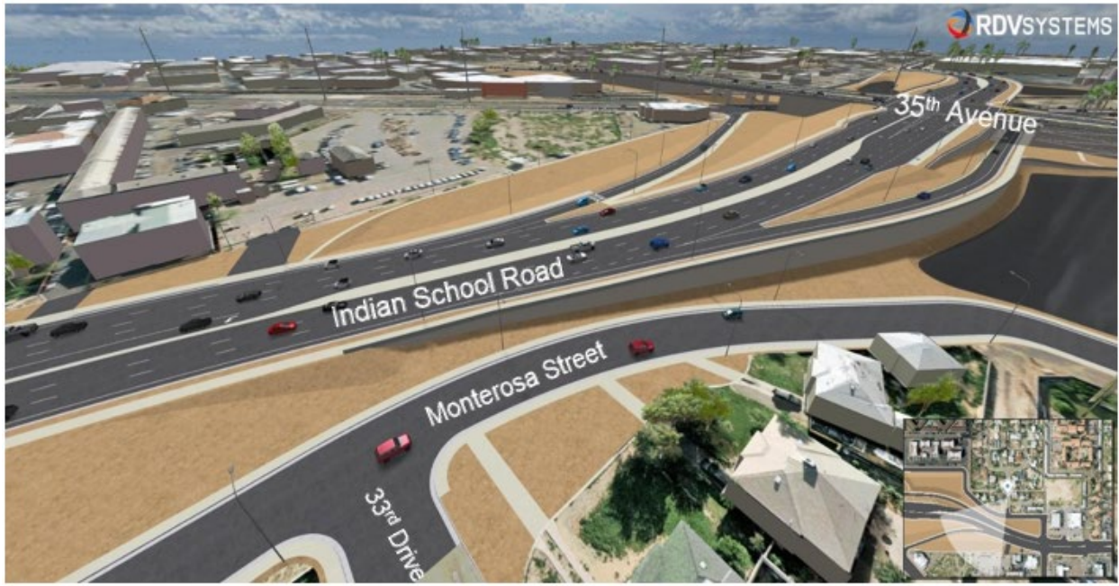
Viewpoint north of Indian School Road along 33rd Drive, looking south along 33rd Drive at the proposed Indian School Road/35th Avenue elevated intersection and Monterosa Street.