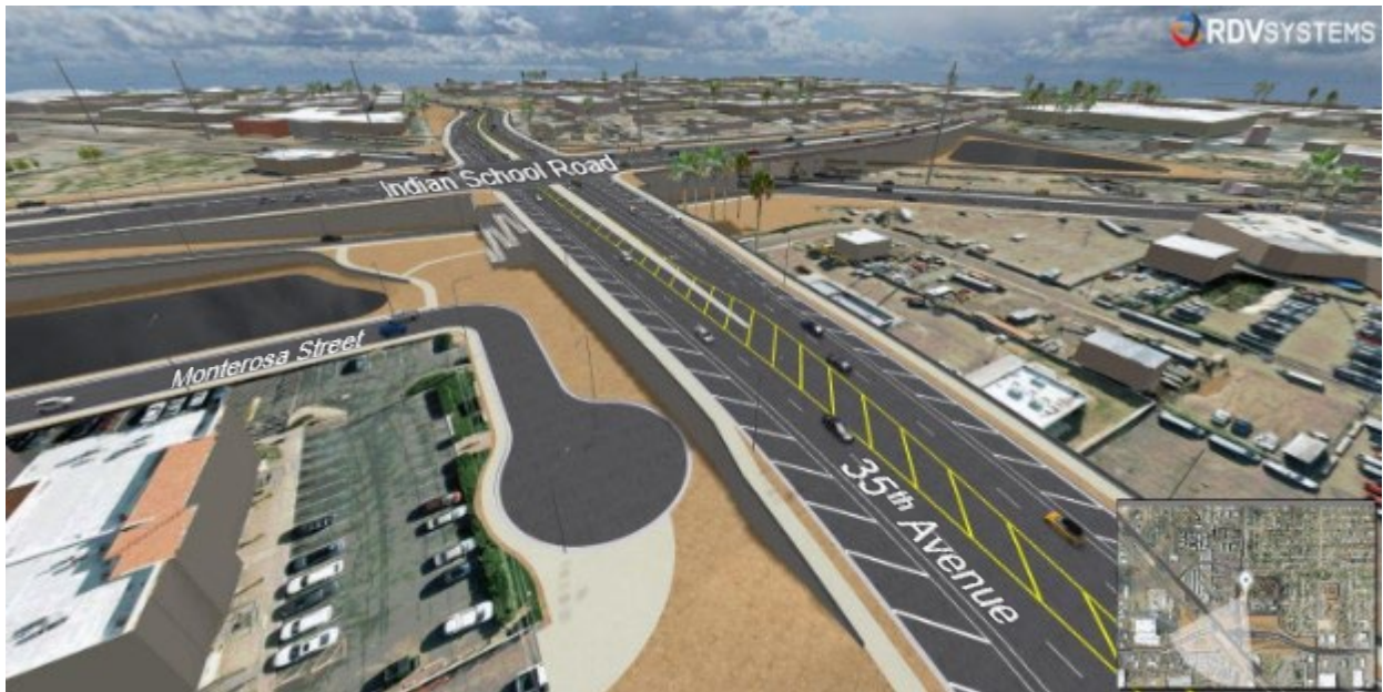
Viewpoint north of Indian School Road along 35 th Avenue, looking south along 35 th Avenue at the proposed Indian School Road/35 th Avenue elevated intersection.