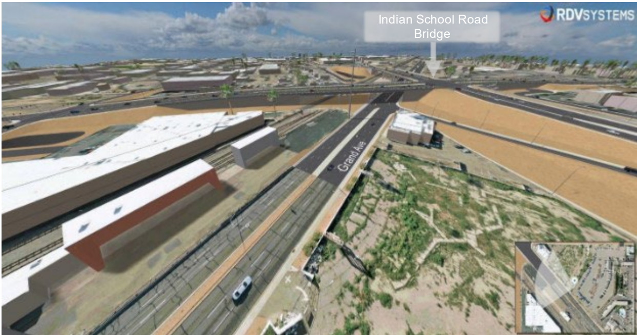
Viewpoint south of Indian School Road along US 60/Grand Avenue, looking north along US60/Grand Avenue at the proposed Indian School Road/35 th Avenue elevated intersection.