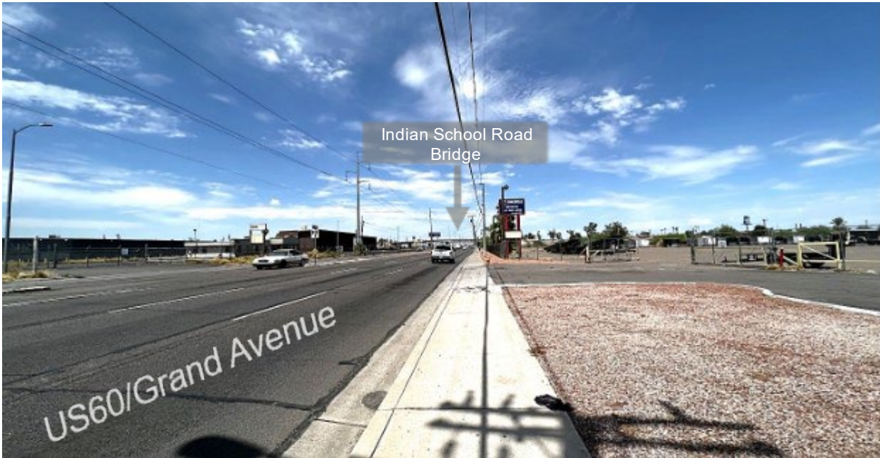
Viewpoint south of Indian School Road along US 60/Grand Avenue, looking north along US60/Grand Avenue at the existing Indian School Road bridge. Photo taken near 3400 Grand Ave, Phoenix, AZ 85017.