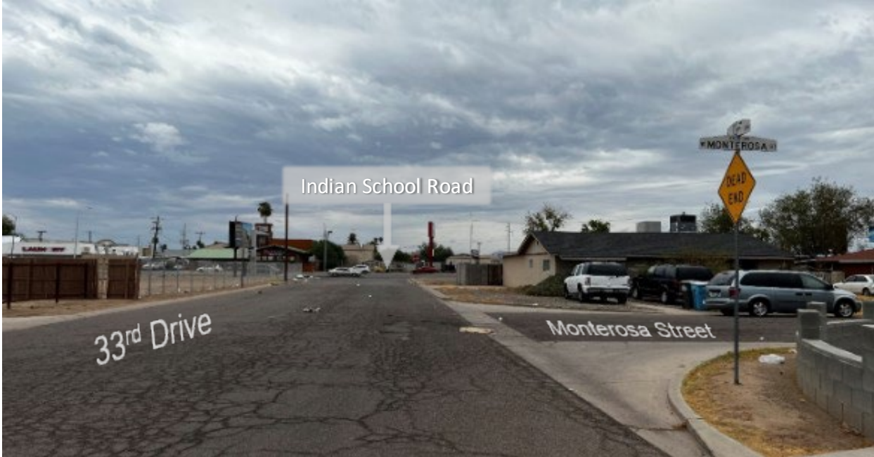
Viewpoint north of Indian School Road along 33rd Drive, looking south along 33rd Drive at the existing residential properties and Indian School Road. Photo taken near 3332 W Monterosa St, Phoenix, AZ 85017.